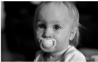
INFANT CARE/ PRESCHOOL